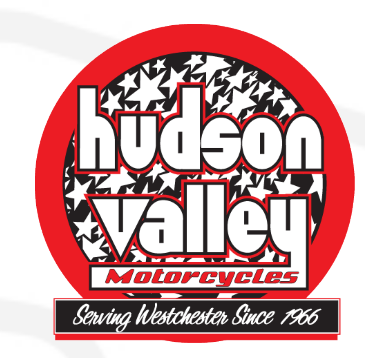
Official Partner of RideHVMC

Fuel Can - there are gas pumps at the track with high octane pump fuel. If you require a special gas we suggest sourcing your own to be transported to Chuckwalla or shipped direct to the track.